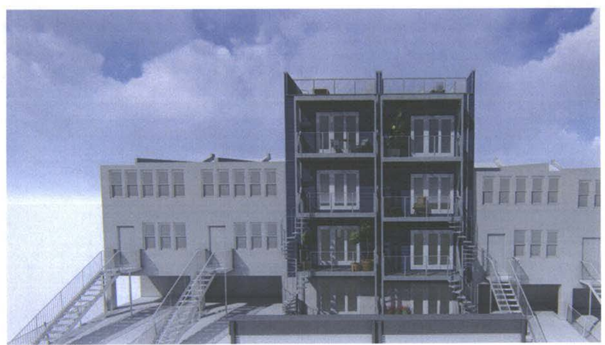
June 21st, 4 PM