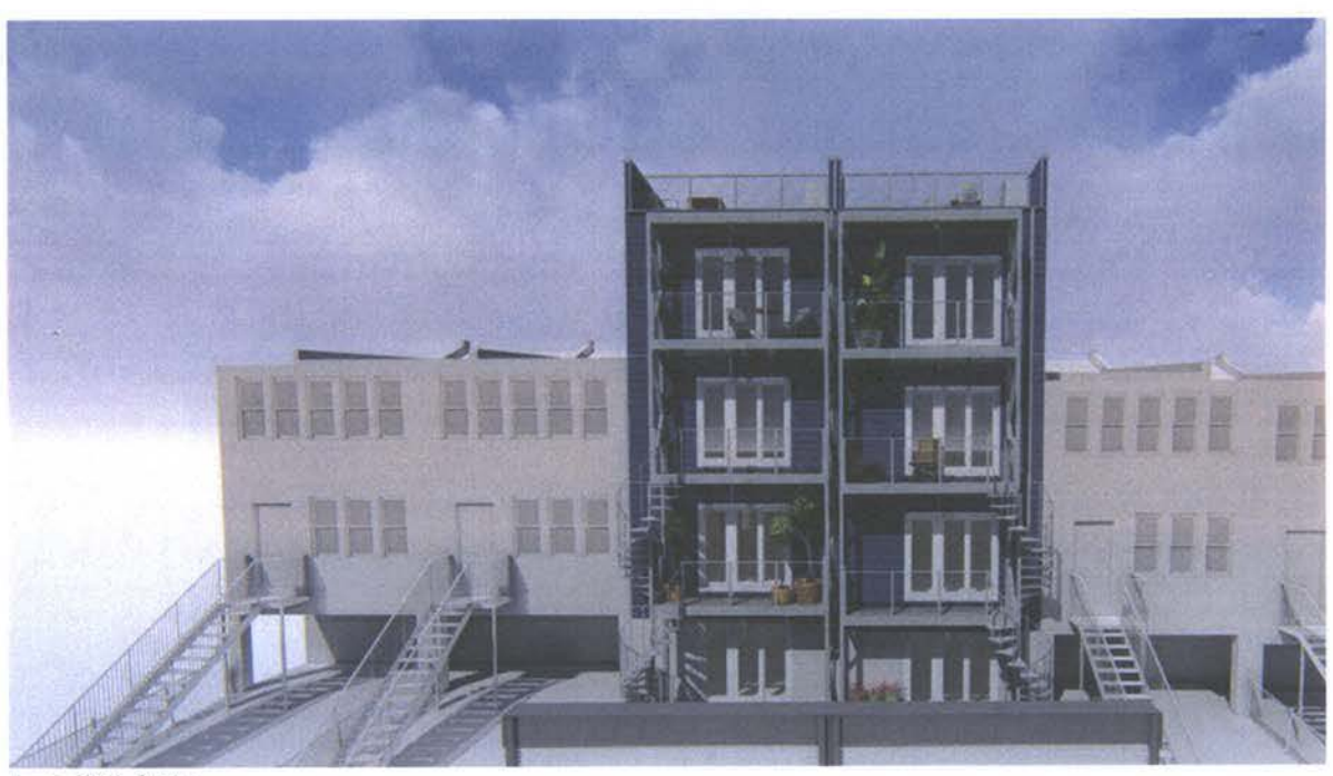
June 21st, 3 PM