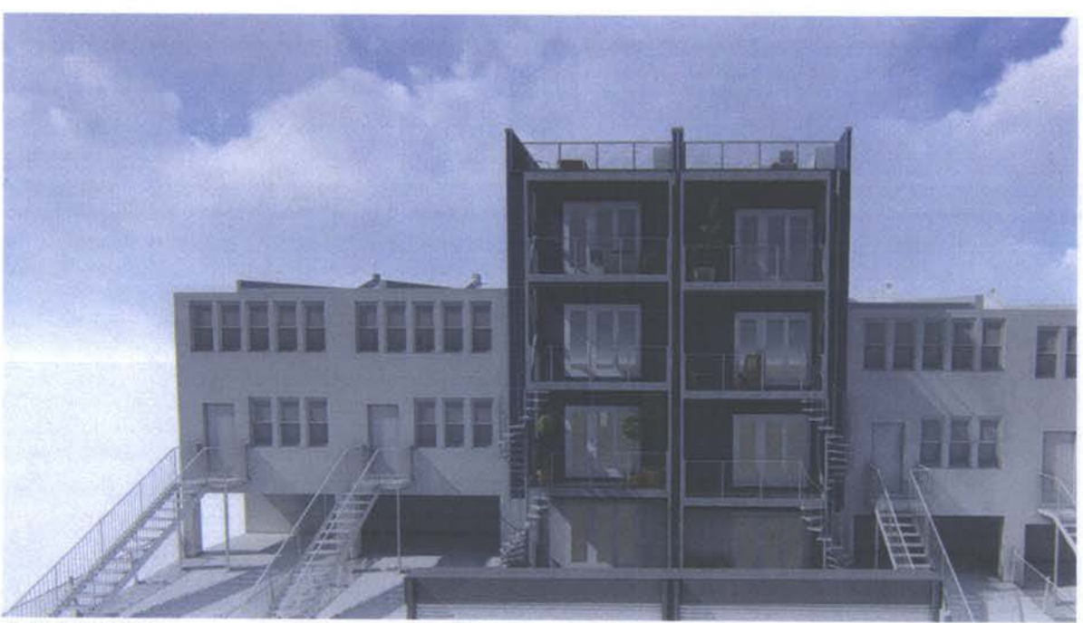
June 21st, 6 PM