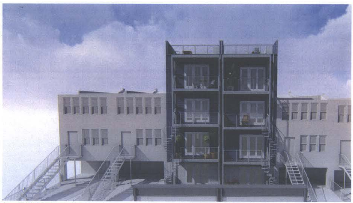
June 21st, 5 PM