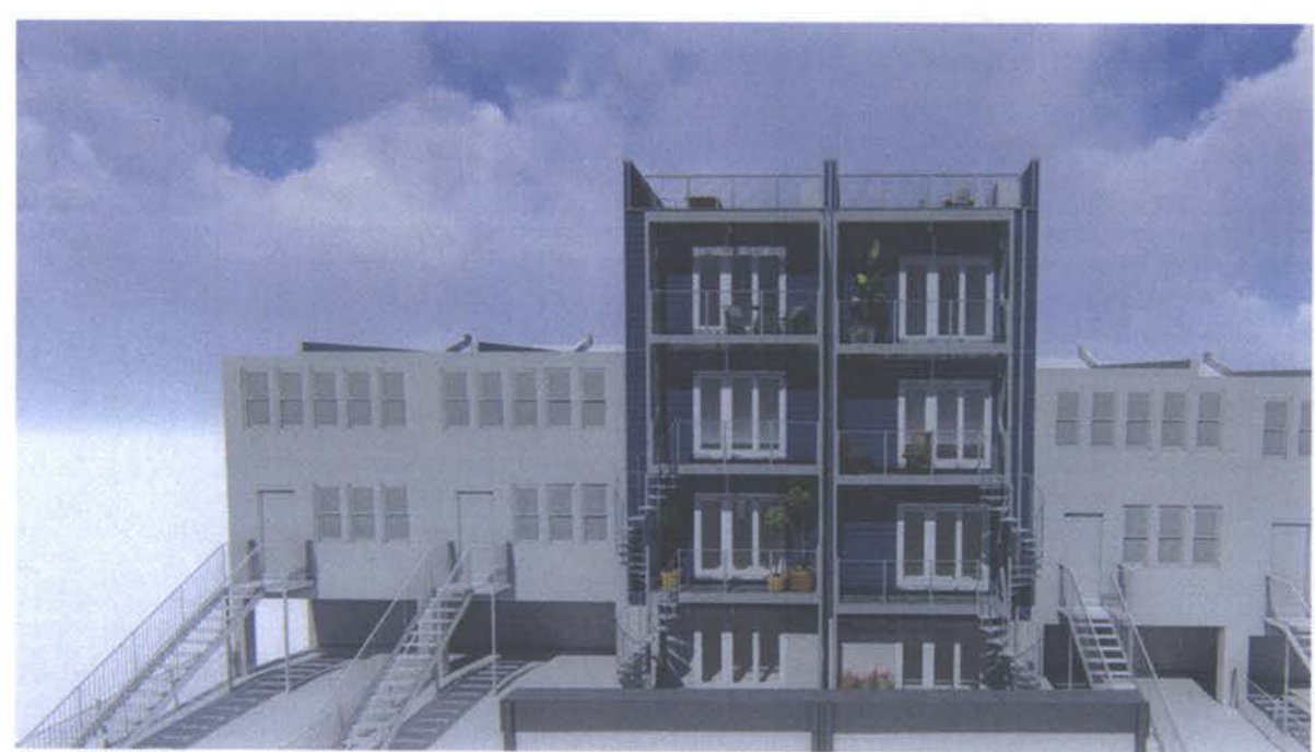
June 21st, 2 PM