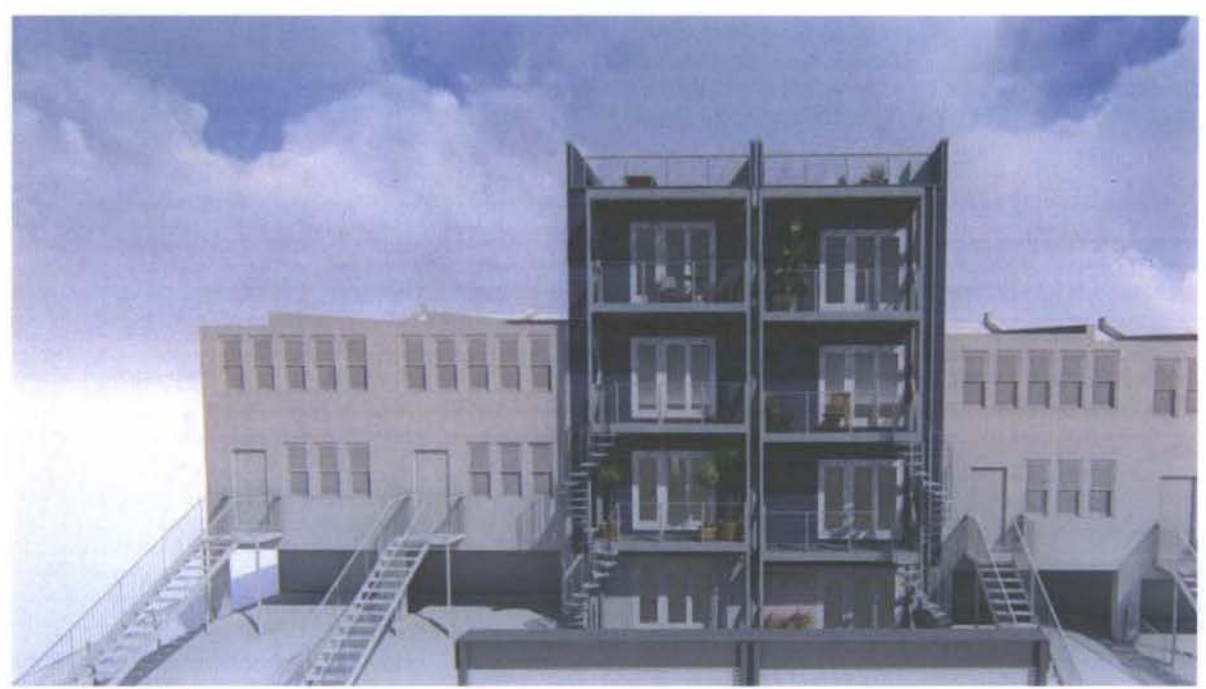
June 21st, 11 AM