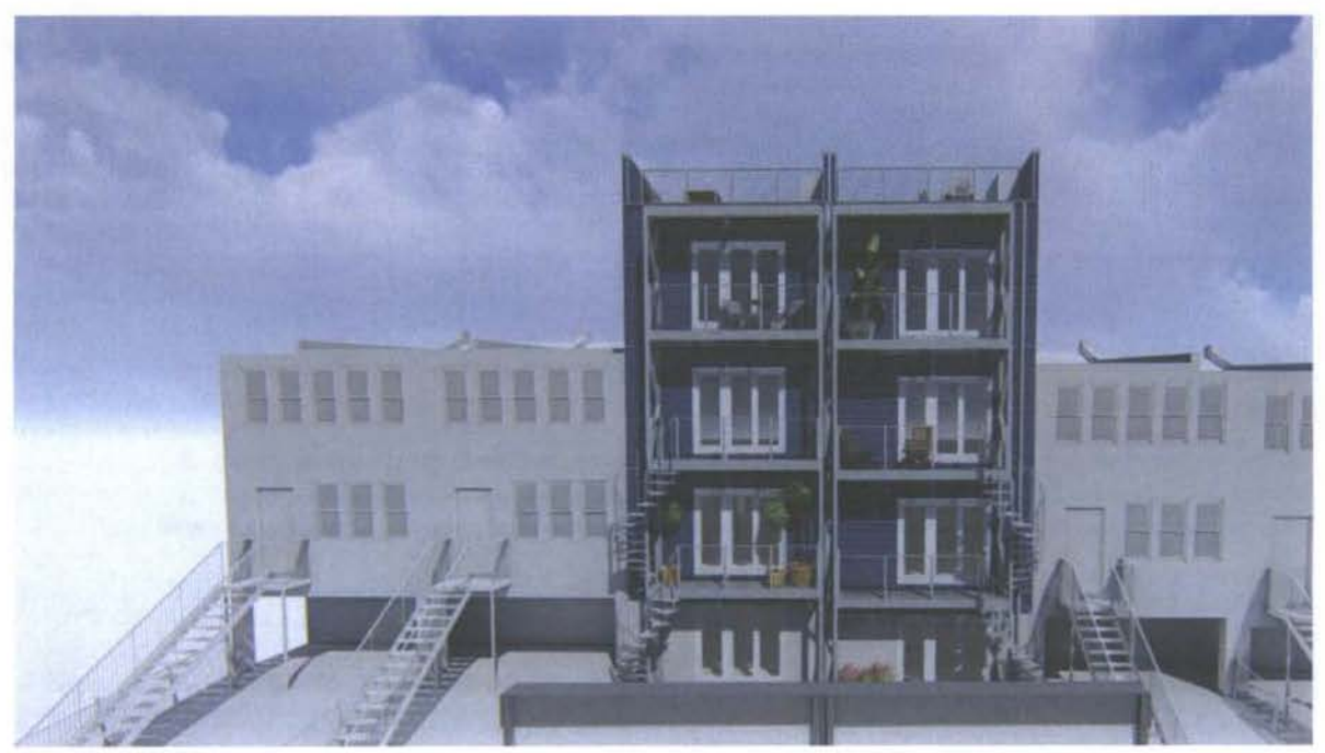
June 21st, 12 PM