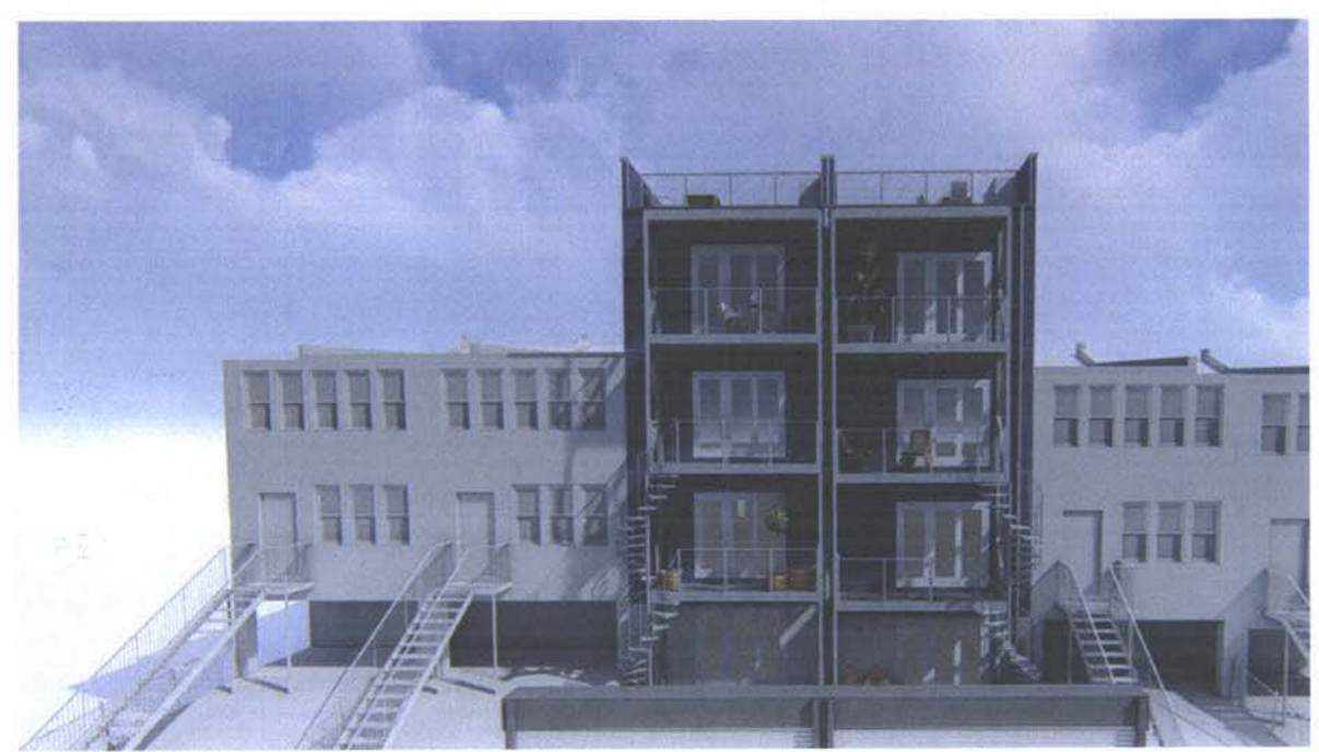
June 21st, 10 AM