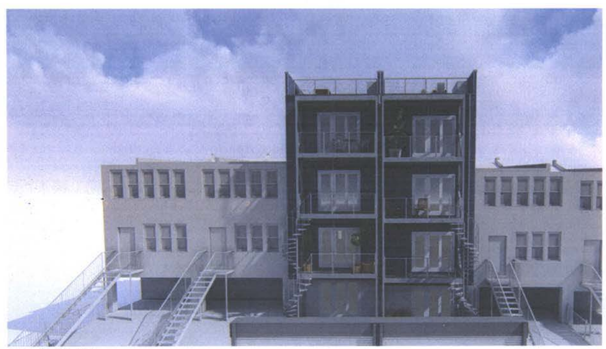
June 21st, 9 AM