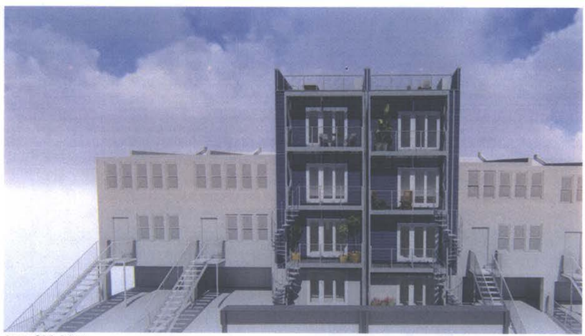
June 21st, 1 PM